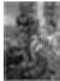
Master's Garden Preschool